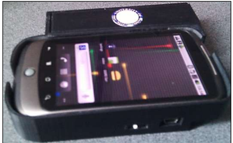
A photograph of the current design. The DDRS features snap-on functionality, USB and Bluetooth connections, as well as a built-in laser. It uses the phone’s on-board GPS sensor for location tracking.

The DDRS can currently measure everyday food items with roughly 90% accuracy, including among its recordings not only caloric content information, but also advanced nutritional information, location, time of day, and more. With this wide array of simultaneous measurements, the DDRS provides the foundation for a high-level of complex behavioral analysis that will undoubtedly improve dietary and medical research and change lives.